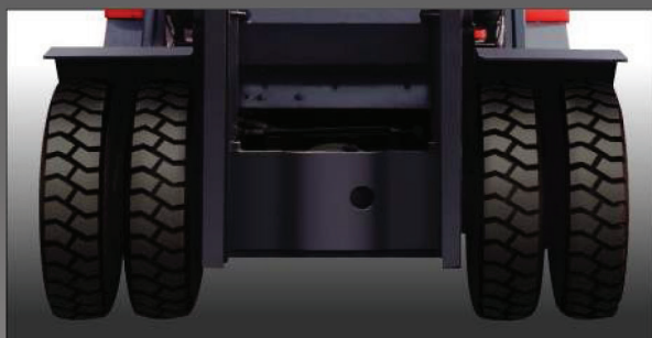
Stable double front wheel