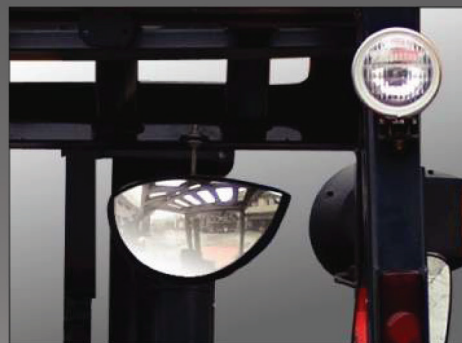
Wide angle rearview mirror