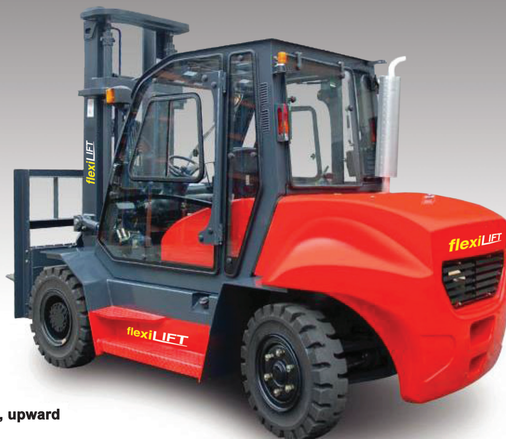
Exhaust pipe, upward